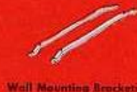
Wall Mounting Brackets